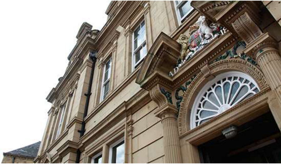
Manor Row Bradford