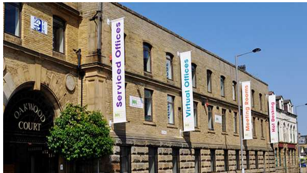
Oakwood Court Bradford