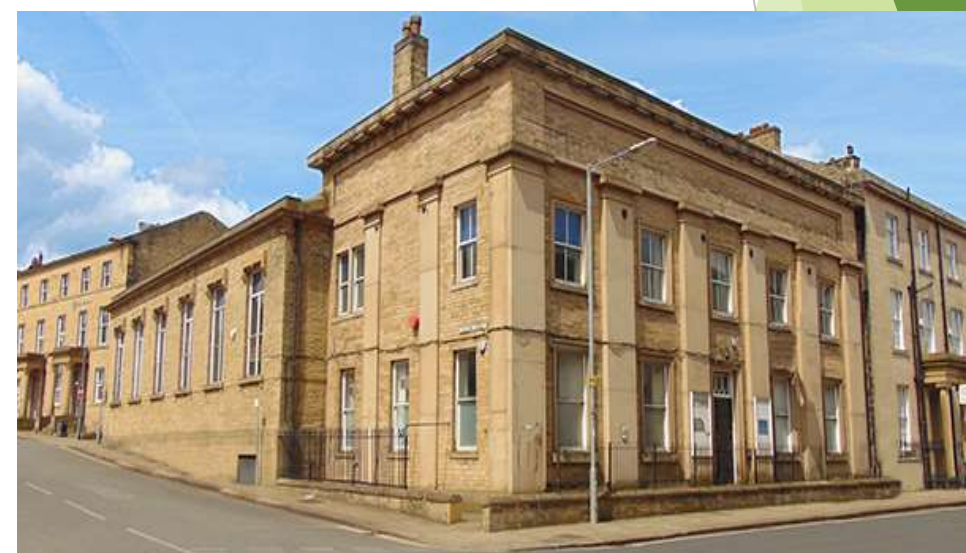
Harrison House Halifax