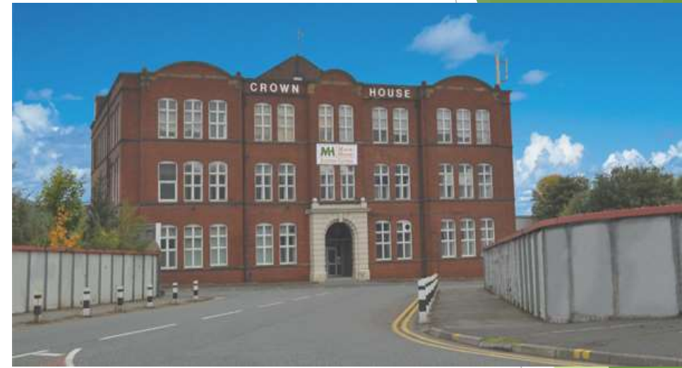
Crown House Leeds